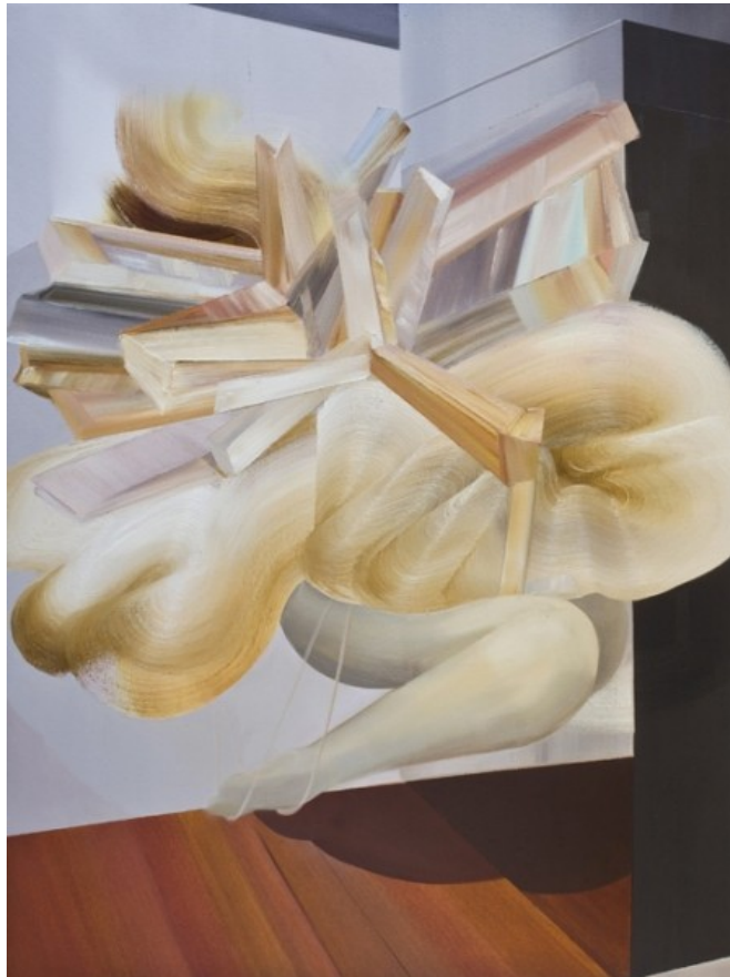
Kristine Moran - 'Somnambule'

"While sleeping the brain loses its grip on the self, the self tumbles into a thousand parts." This became the underpinning for the 2011 exhibition titled Protean Slip at the Nicelle Beauchene Gallery in NYC. The painted figures in that series transform into shadowy, fragmented shapes, floating against a nocturnal landscape.