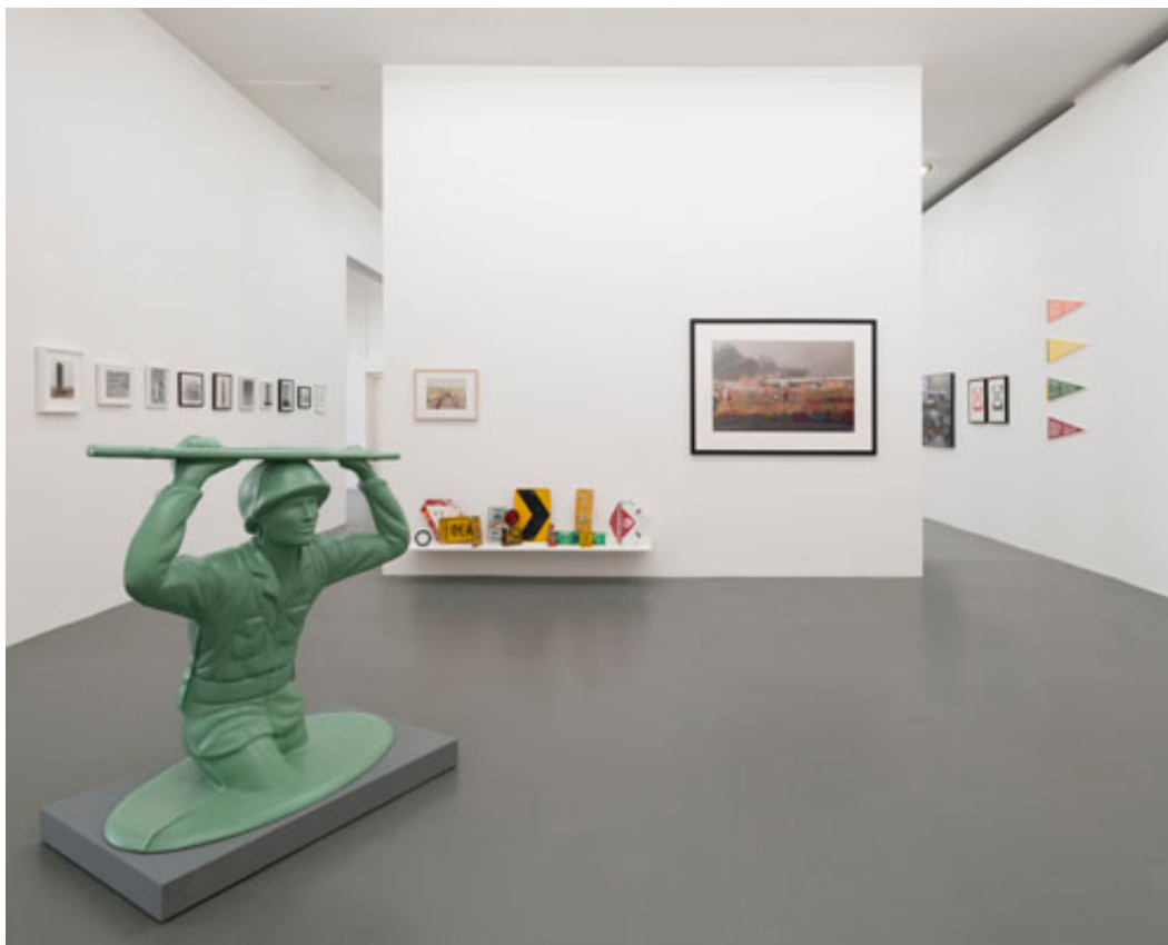
Vietnam Swamp Soldier , 2000; Robert Rauschenberg, various collected objects, c.2000; Peter Goin, Hanford , 1991; Anonymous photograph of plane crash on runway, Tenerife, 1997, installation view Witte de With Center for Contemporary Art, 2015.

nuclear disaster. In short it comprises the lifetime of events, images, objects and people that have affected this cultural magpie. Literature makes an appearance in Coupland's 50 Books I Have Read More than Once (2015), a room-sized sculpture made of stacked beams whose lengths correspond to the importance of the book whose cover is pasted on the beam's edge. I noted a couple works by Joan Didion, Bret Easton Ellis's Less than Zero (1985), Mike Davis's City of Quartz (1990), probably because those are on my own shelves. Unsurprisingly, given Coupland's writerly prowess, the written word and the visual realm of objects on display here don't co-exist as binaries, even if the exhibition guide pairs each room with citations from Coupland's prolific bibliography. But there's no palpable tension or conflict between the visual and the textual, which might have more to do with the irrelevance of such oppositions in contemporary art and its discourses than it does with the artworks included. You don't need the accompanying guide to 'get' the exhibition, but the exhibition is enriched by the presence of the texts. Likewise, you don't have to see this exhibition to revel in Coupland's words.