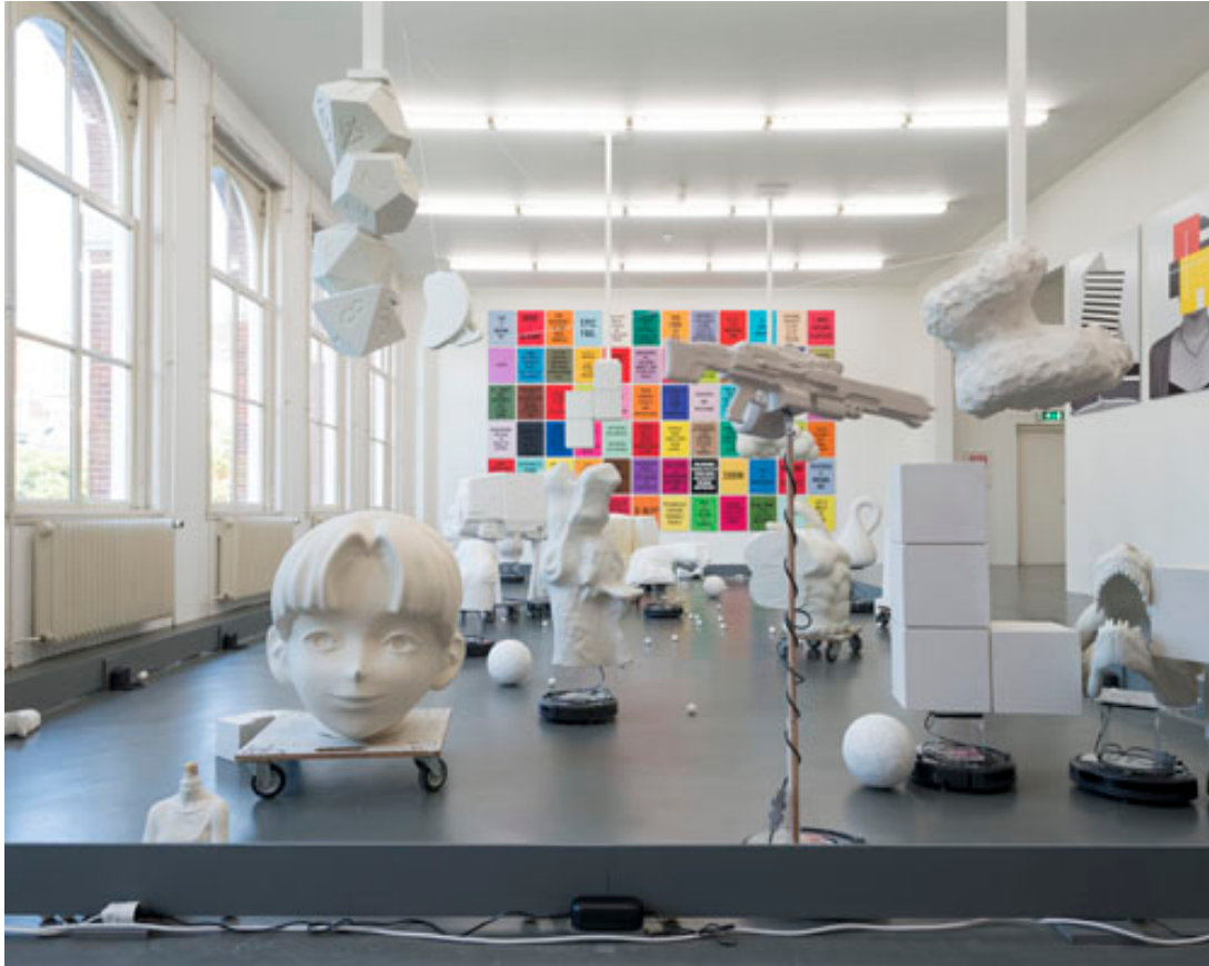
The Living Internet , 2015; Slogans for the Twenty-First Century , 2011-ongoing; Deep Face , 2015, installation view Witte de With Center for Contemporary Art, 2015.

stored that old power cord. ‘Bit Rot’ can be read as a sceptically hopeful text because it suggests there is still something worth saving, still something ‘desirable’ and ‘historically valuable,’ to use Coupland’s own words. I’m not sure one can say the same thing about the exhibition – and in any case, the hope is not utopian, since Coupland claims to have shed ‘all of my twentieth century notions of what the future is and could be.’